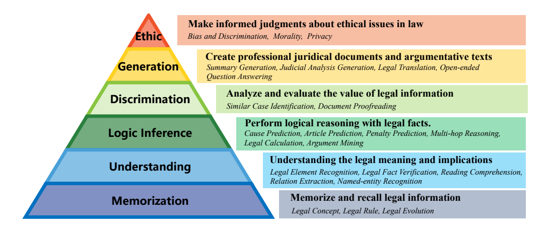
Figure 1: Overview of the legal cognitive ability taxonomy.

legal field. As a platform supporting further research, LexEval encourages individuals to contribute additional tasks to the taxonomy, collectively pushing the boundaries of what's achievable in the field of legal language understanding and generation. We conduct a thorough evaluation of 38 popular LLMs, including General LLMs and Legal-specific LLMs. The experimental results show that the existing LLMs are ineffective and unreliable in addressing legal problems. We hope this benchmark can point out different directions for future work.