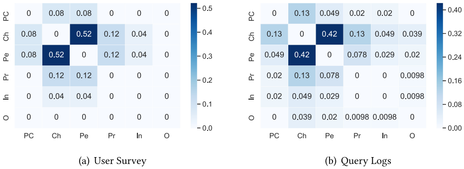
Fig. 3. Confusion matrix of the “Multi” in the user survey (a) and query logs (b). Each matrix is a symmetric one and the number in the grid denotes the normalized frequency of co-occurrence.

Mixture Analysis. Nearly 10% of search tasks are tagged as Multi in both datasets. Note that Multi in Table 1 consists of two parts, i.e., more than two annotators labeled as Multi (7.27% and 4.85% in the survey and logs, respectively) or three annotators gave completely different labels (4.55% and 5.18% in the survey and logs, respectively). To deeply analyze it, we visualize the co-occurrence of different intents, as shown in Figure 3. For each sample belonging to the first part, we manually processed the annotators’ explanations, from which we extracted all potential intents. We considered all annotated categories as possible intents for each sample belonging to the second part. Then, we count each pair in the possible intent set as one co-occurrence. For example, the intent set, “Ch+Pr+Pe,” contributes one occurrence for the “Ch-Pe,” “Ch-Pr,” and “Pe-Pr” pairs, respectively. Numbers in Figure 3 are normalized by the number of pairs.