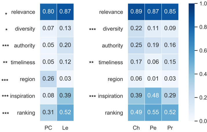
Fig. 4. The distribution of click reasons across different intents. The number in the grid denotes the proportion of the users that select the factor under the intent, correspondingly. “*/**/**” indicates the statistical significance at p < 0.05/0.01/0.001 level by one-way ANOVA, respectively.

patient and spend more time examining the content of case documents in Learning . With the requirement for high precision and recall, users with Particular Case(s) intent might put more effort into exploring the SERPs. Among Characterization , Penalty , and Procedure , the Penalty tasks always involve the most search effort. Meanwhile, we observe that users with Procedure intent seem quite patient but less satisfied with the system results.